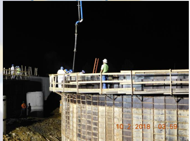
Clarifier wall pour 10-2-18

locations. Installation of the wet well for the effluent pump station is progressing. This has been a challenging installation, given the depth requirements, and amount of rock removal required. In the coming weeks, it is anticipated that various buildings will begin to be erected, such as the new administration building, the electrical building, and the sludge dewatering building.