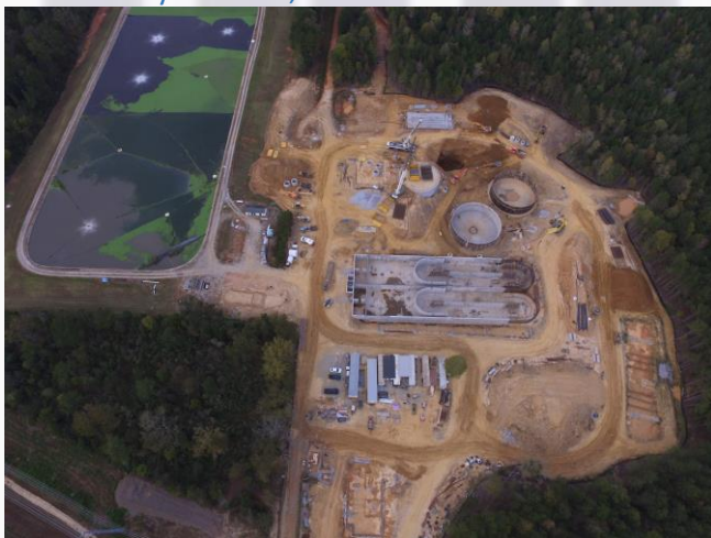
Aerial view of construction progress – photo dated 10-23-18

The new wastewater treatment facility is moving along at a pace that appears to be ahead of schedule. Much of the concrete work has been completed for the aeration basins, clarifiers, sludge digester and chlorine contact chamber. Plant piping is substantially installed, as well as conduit and duct