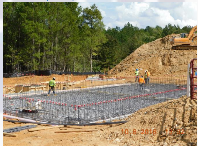
Placing rebar in the floor slab of the chlorine contact chamber

As previously noted, construction appears to be ahead of schedule. The contractor has a final completion date that is currently September 5, 2019, however, additional days may be allowed for weather related delays if required.